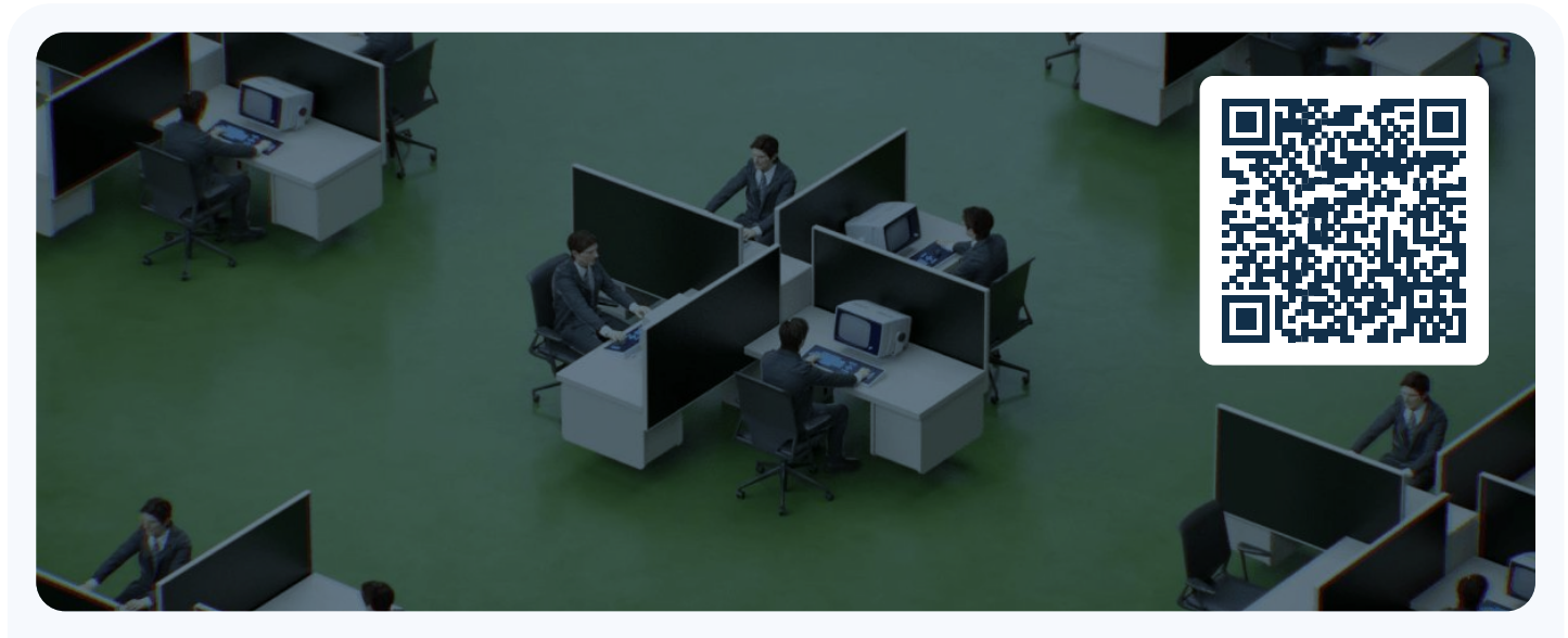
Rotina de trabalho em inglês

Explore estes recursos para expandir seu vocabulário corporativo: