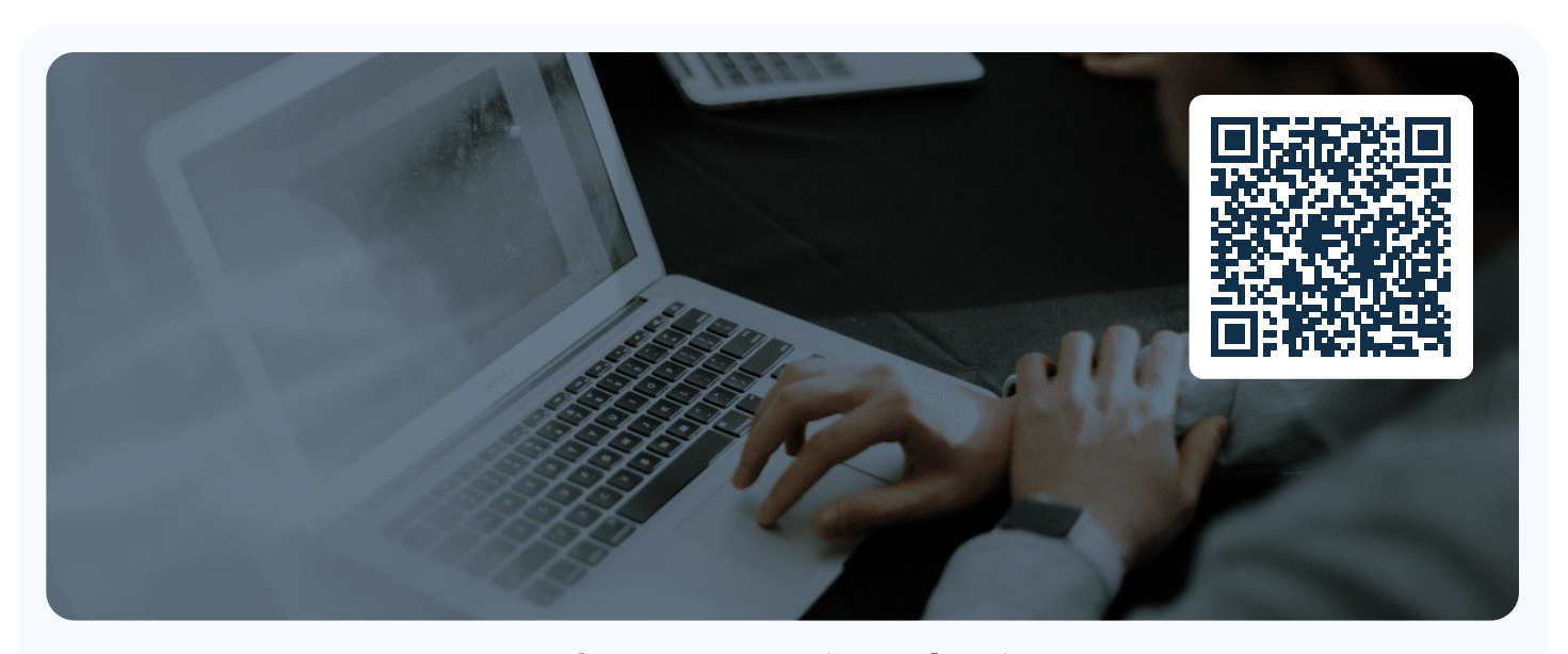
Inglês corporativo técnico: vocabulário útil para sua profissão