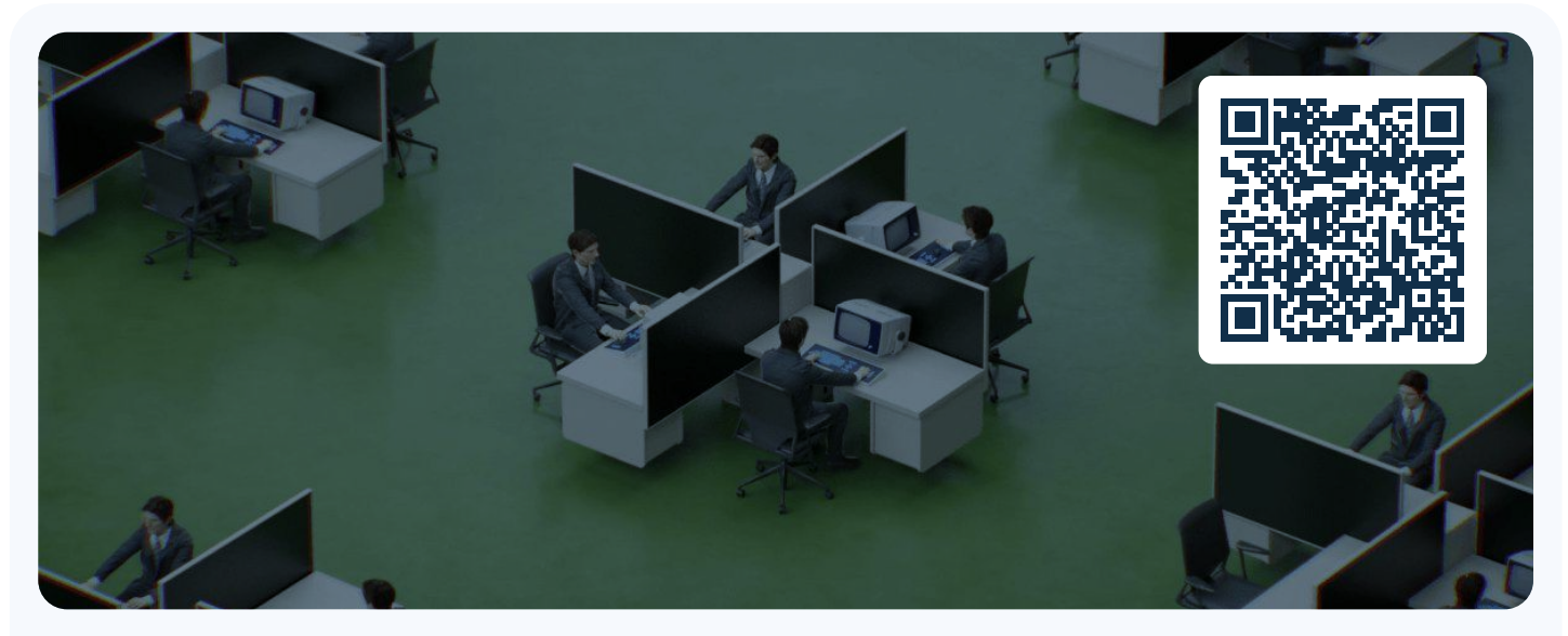
Rotina de trabalho em inglês

Explore estes recursos para expandir seu vocabulário corporativo: